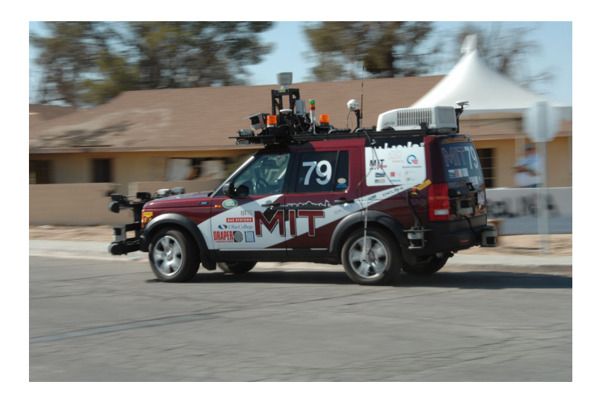
Figure 1-3: MIT's Urban Challenge vehicle. The grey cylindrical sensor at the top is a Velodyne LIDAR sensor. Below it sits a row of other LIDAR sensors and cameras.

spurred significant interest, and brought together industry groups and universities to try to extend the capabilities of fully autonomous vehicles.<sup>17</sup> While the Grand Challenge technologies bear little resemblance to current navigation approaches designed to deal with the complexities of real-world road environments,<sup>18</sup> the Urban Challenge vehicles, both via their sensor setups and algorithmic approaches to navigation, can be interpreted as another step along the path to the modern self-driving car, as instantiated within Google's design approach.