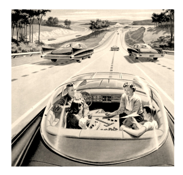
Figure 1-2: Image from an advertisement titled "Power Companies Build for Your New Electric Living," Saturday Evening Post , 1950s.

ways: the car was "under the direction of an 'electronic brain' on a dream highway of the future" [Wetmore, 2003, p. 7]. This would have been the realization of the New York World's Fair exhibit from two decades earlier. Building to make this optimistic vision of GM's engineering ability a reality, engineers led by Joseph Bidwell and Lawrence Hafstad within GM Research installed "pick-up coils" on a 1958 Chevrolet: through a feedback system like that of the "electric eye automobile," these coils would detect a wire embedded in the road and adjust the vehicle's steering [Wetmore, 2003, p. 7]. Consistent with the image presented in the Saturday Evening Post , and a significant advance from Futurama's mechanical "half-pipes," alternating current would be the control mechanism of the future. A GM press release announced: